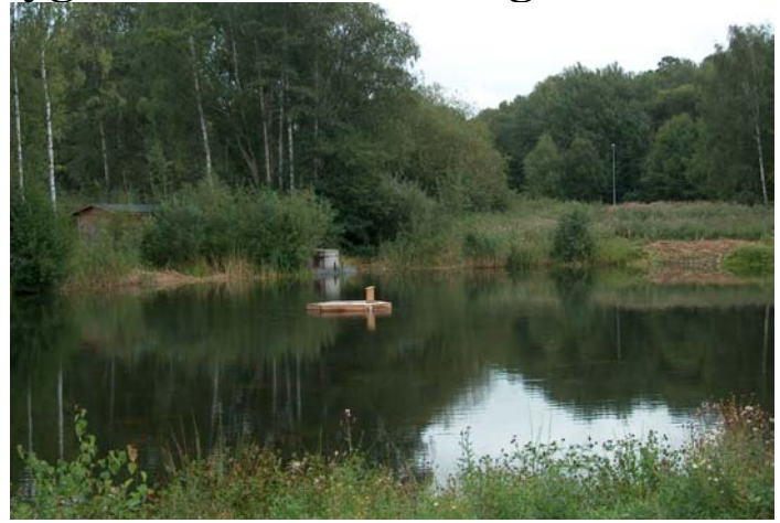
After installation of Airturbo.