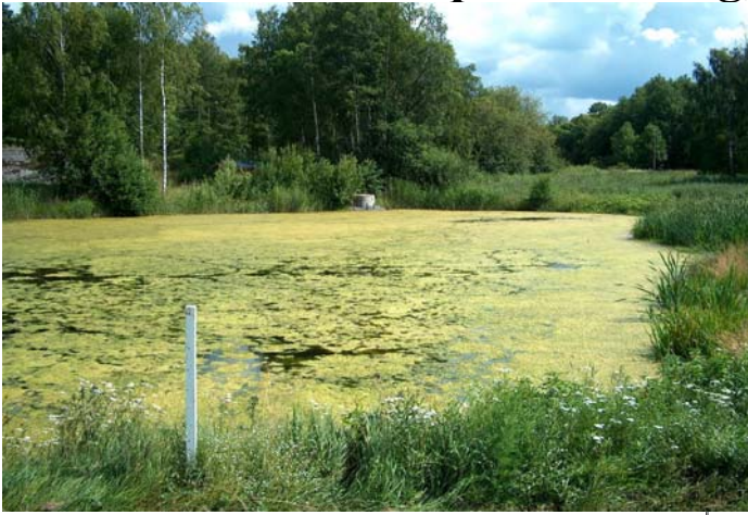
Pond before installation.