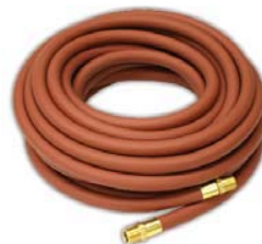
AIR & WATER HOSE ASSEMBLY LOW PRESSURE

North America: 800-444-3134 Asia: +63 (45) 625-6624 Europe: +44 (0) 1536 406999 Latin America: 260-489-1685