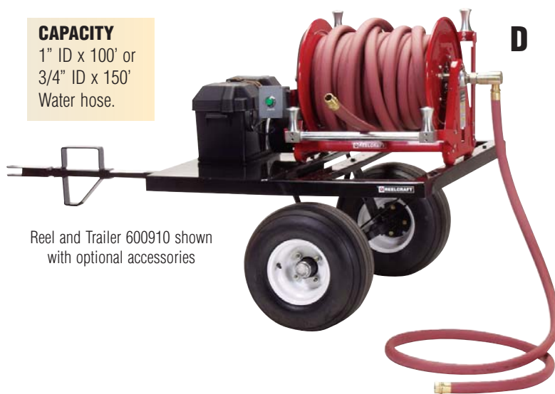
Reel and Trailer 600910 shown with optional accessories

CAPACITY 1" ID x 100' or 3/4" ID x 150' Water hose.