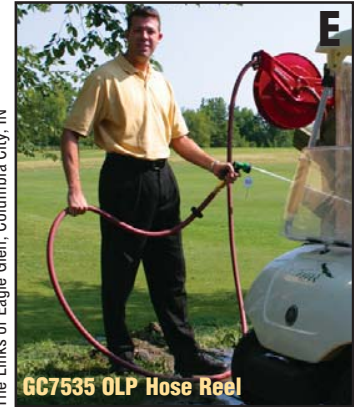
The Links of Eagle Glen, Columbia City, IN

Improve hose management at each wash pad station with Reelcraft reels.