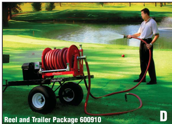
Reel and Trailer Package 600910 D

Great for golf courses, athletic fields, parks & rec.