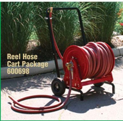
Reel Hose Cart Package 600698

Orchard Ridge Country Club Fort Wayne, IN