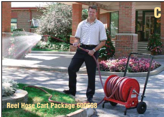
Reel Hose Cart Package 600698

Great for golf courses, athletic fields, parks & rec.