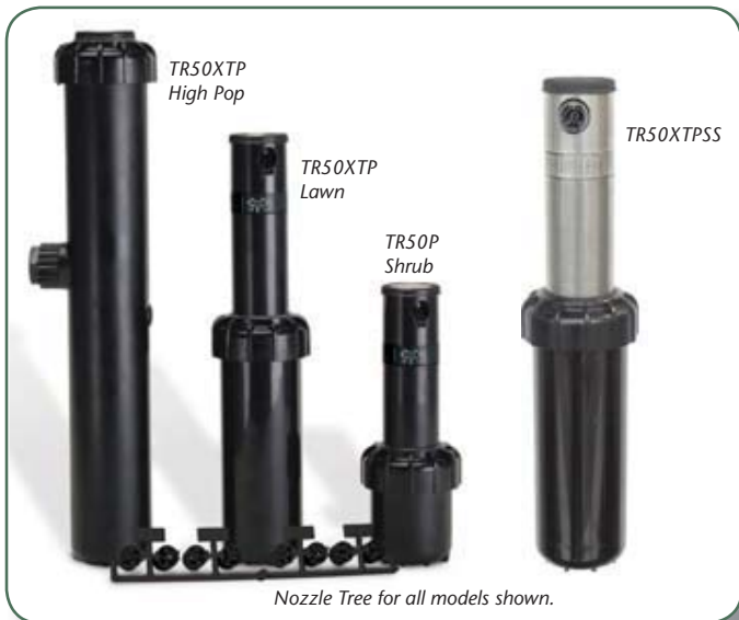
Nozzle Tree for all models shown.